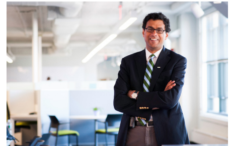
Dr. Atul Gawande